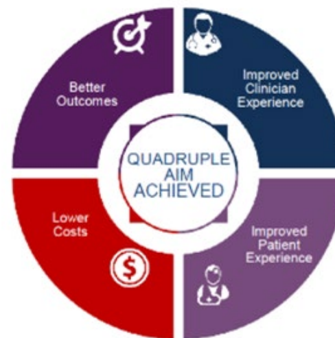
Diagram 1: Quadruple aim approach