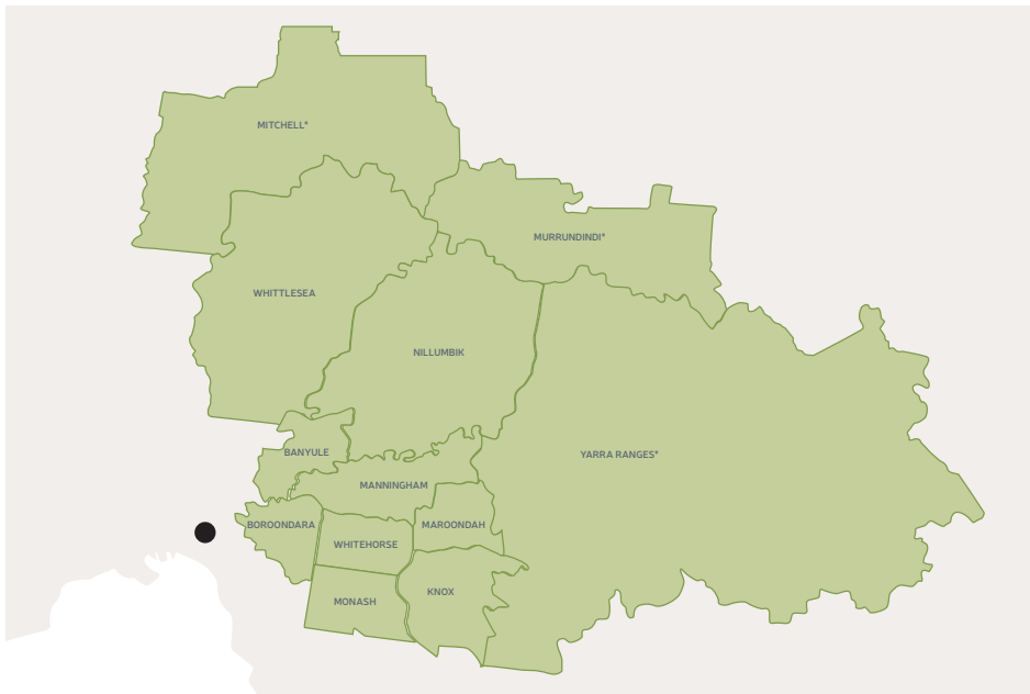
Figure 1 EMPHN catchment