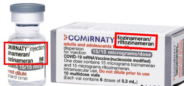
Example thawed use-by date label

Pfizer Bivalent (BA.4-5) 12 years+ (Grey) Batch: GE3042 Defrost Date: 01/12/2022 Use By Date: 09/02/2023 Store at 2°- 8°C & protected from light. DO NOT RE-FREEZE